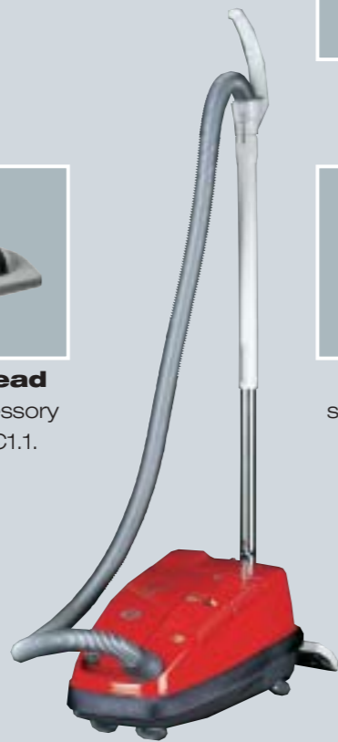
SEBO air belt C2.1