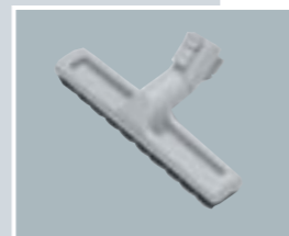
Parquet Brush standard accessory tool for the C2.1 and the C3.1.

The SEBO air belt C3.1 includes an electrified telescopic tube designed to accommodate the optional ET-H or the ET-C power head, for thorough brushing and optimal cleaning of your carpet. It also offers suction control at the handle and the Parquet Brush for hard floors.