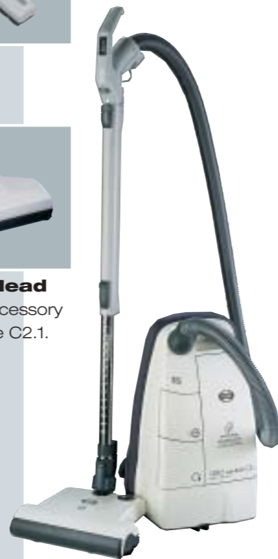
SEBO air belt C3.1 (Shown with the optional ET-H power head)