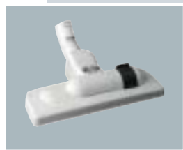
Combo Head standard accessory tool for the C1.1.