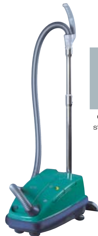
SEBO air belt C1.1