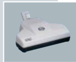
Turbo Head standard accessory tool for the C2.1.